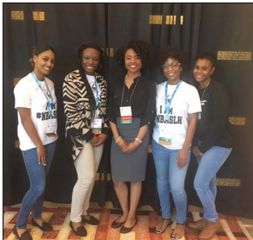
Students from the Old Dominion University affiliate of NBASLH at the 2016 Convention.