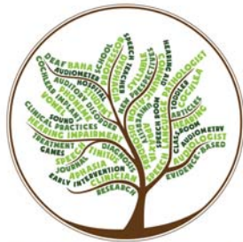
NBASLH Expanding in Research & Clinical Practice

N BASLH Expanding in Research and Clinical Practice is NBASLH's 2017 Convention theme! This theme represents growth in membership, professional relevance and evidence-based practice. We had more than 300 attendees in 2016! We will continue that momentum by bringing you highlighted speakers that will educate and stimulate you with new perspectives in the field of communication science and disorders. June 30, 2016, marked the 39th Anniversary of NBASLH, and we are thrilled to host our Annual Convention in the exciting city of Atlanta, Georgia.